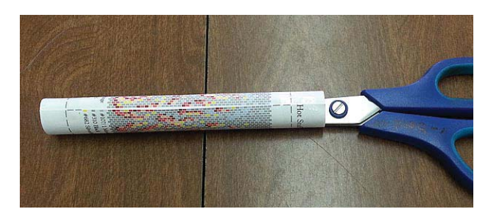
STEP 4: Cut a piece of tape long enough to tape the whole edge. Place the tape on the edge that overlaps the other side.

STEP 3: Lay it on its side and place something inside to keep it from rolling.